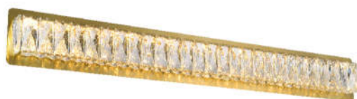
Gold Item No:3502W35G